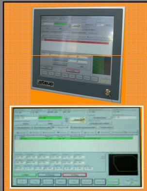
MACRO - INPUT