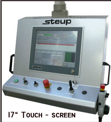
17" TOUCH - SCREEN